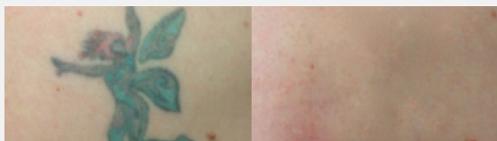
Before & After 5 Treatments