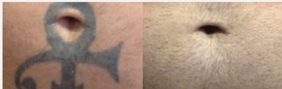
Before & After 4 Treatments