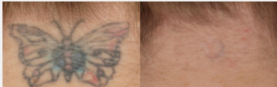
Before & After 6 Treatments