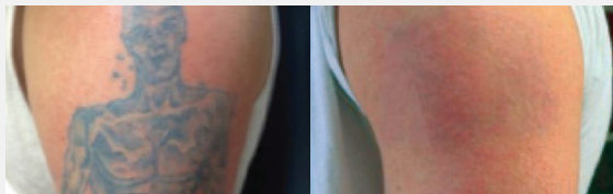
Before & After 8 Treatments